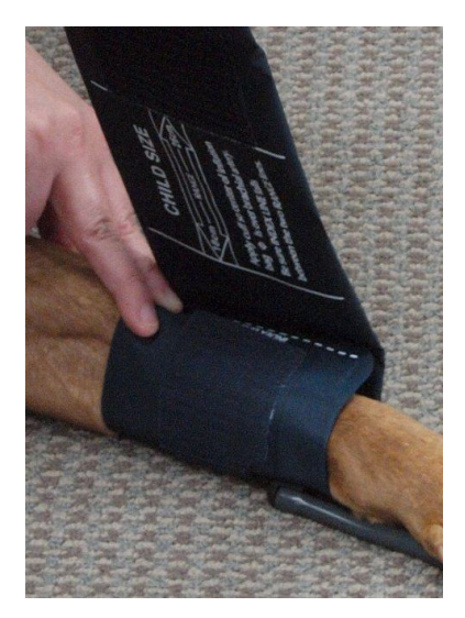
Cuff is too large. Index line won't fall within scale.