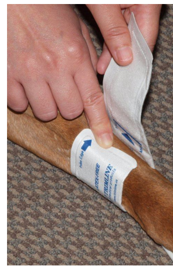
Cuff is too small. Index edge won't fall within scale.