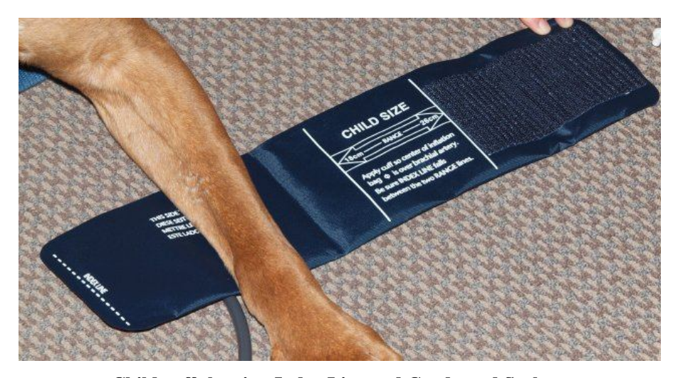
Child cuff showing Index Line and Graduated Scale

The cuffs are all graduated so you can easily find the correct sized cuff to use. There is an index point marked on the leading edge of the cuff. When wrapped around the limb, this index point must be within the graduated scale.