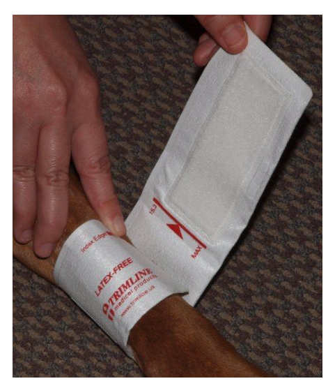
Cuff is correct size.